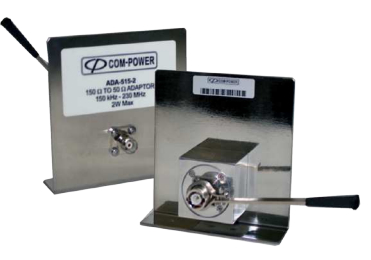
ADA-515-2 Adapter Set